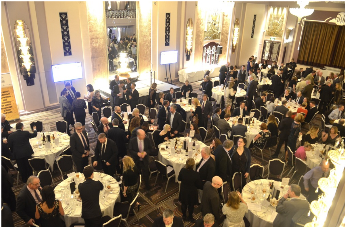
The Annual Dinner on 1st December returns to the Park Lane Hotel, London